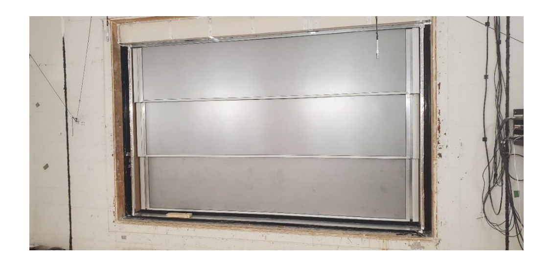
Figure 1: Wall Specimen

Proprietary details of the specimen are withheld from this report at the request of the client.