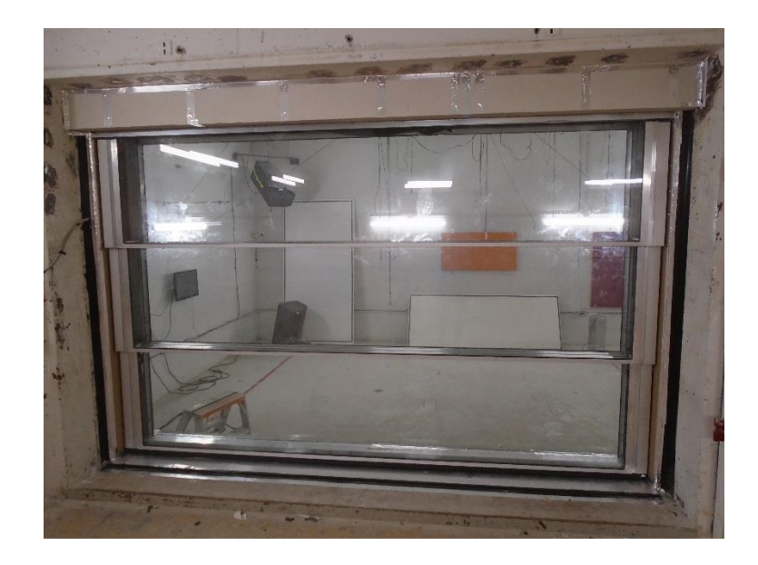
Figure 1: Wall Specimen

Proprietary details of the specimen are withheld from this report at the request of the client.