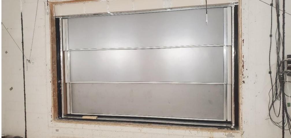
Figure 1: Wall Specimen

Proprietary details of the specimen are withheld from this report at the request of the client.